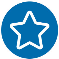
Section 1: Introduction