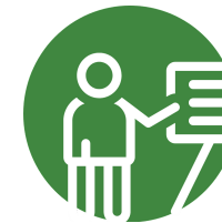
Section 4: Instructional Services and Approaches