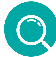
Section 3: Identification of TAG-Eligible Students