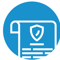
Section 2: School District Policy on the Education of Talented and Gifted